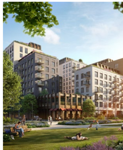
Proposed new homes - Brent Cross Town