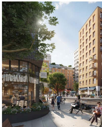
Proposed High Street South - Brent Cross Town

Brent Cross Town will respond to the local context which is rich and diverse. The vision is to create a place with sport, play, health and well-being at its heart, with good public transport infrastructure and a new and improved network of walking and cycle routes connecting it with the surrounding communities.